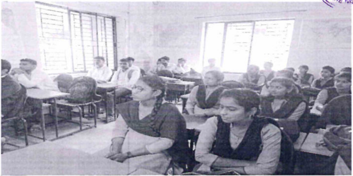
Diploma Course in Tourism Class